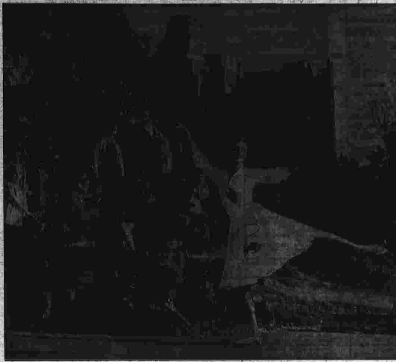
Juliet Prowse accompanied by a group of children in "Use Your Imagination" at the Alice in Wonderland

Maybe I shouldn't blame the defection of Jack Paar on television because he decided all by himself to go up to Vermont or maybe New Hampshire and run his own radio station. He'll